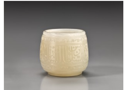
Cup with calligraphic inscriptions, 1440–1460. Probably Uzbekistan; Samarqand, Timurid period (1370–1507). Nephrite. Asian Art Museum, The Avery Brundage Collection, B60J619.