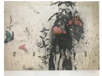
Loving the Earth I by Yoshiko Imamura. Etching and collage of silver leaf.