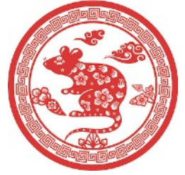
Year of the Rat

Join us to celebrate the Year of the Rat and the coming of spring in many cultures across Asia. We will feast on a tasty multi-course dinner on the second floor of one of our favorite Chinese restaurants, Ton Kiang. Sign up now to ensure your place at this most enjoyable social event. Wine will be served.