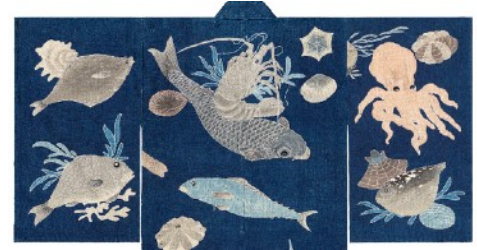
Cotton tsutsugaki (freehand resist). Japan, 20th century.