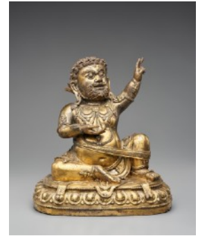
The Buddhist adept Virupa, approx. 1400–1450. China; Beijing, Ming dynasty (1368–1644). Bronze with gilding. Asian Art Museum of San Francisco, The Avery Brundage Collection, B62B20.

Please note. If you sign up for 10:00 a.m., your appraisal will be in the morning. If you sign up for 11:30 a.m., your appraisal will be after the lecture and refreshments.